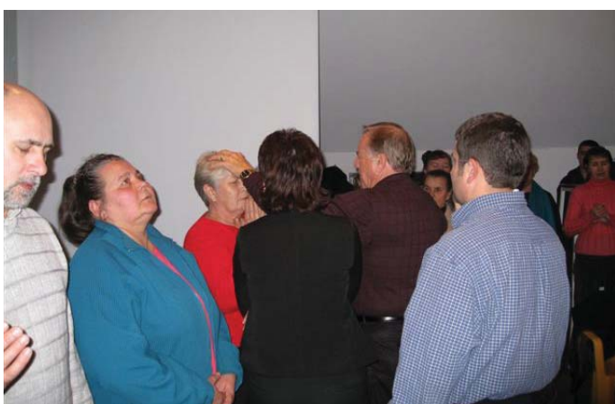
Photo: Harley praying for the ministers before being deployed to their areas of ministry

taught two hours each day and I did the rest. The hunger and eagerness of these young selected ministers to learn more about ministry and "church planting" made the classes exciting and class time was never boring or burdensome.