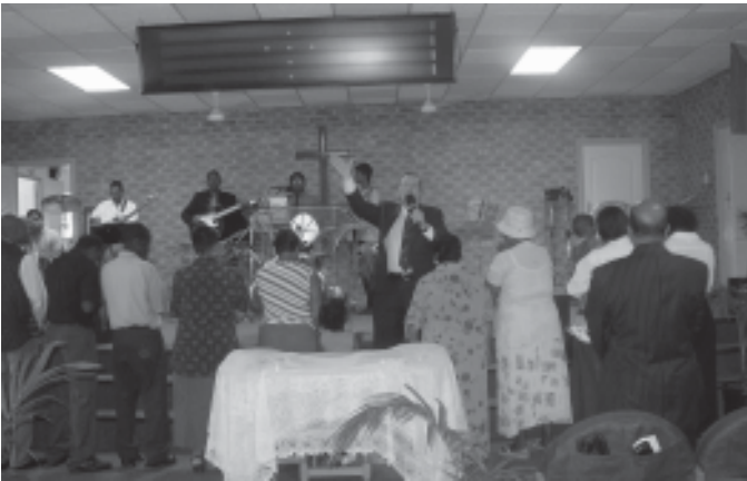
Winning Souls in AFRICA: Altar filled with seekers as Harley calls people to Christ (2004).