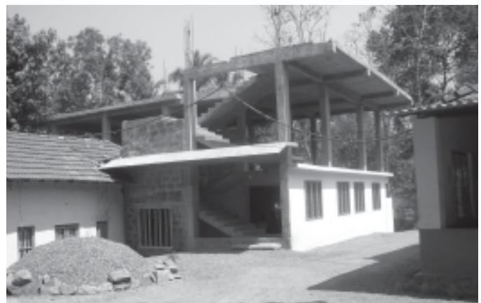
Photo: There are now four floors like these completed. Roof is currently being finished.

Wonderful progress is being made in the building construction of phase one of our MTC building program. Phase one consists of four floors accommodating a kitchen-dinning hall, class-rooms, library, two guest quarters, offices and faculty lounge. The fourth floor was recently set and work is now being done to finalize the roof, walls, electric and plumbing. When I returned home from India in March we needed $20,000 to complete this phase of the project. I am happy to report that now we are down to only $11,000 to finish the job.