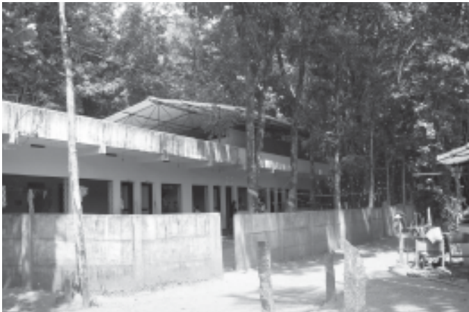
Photo: One of the three elementary schools where both Muslim and Hindu children are enrolled.