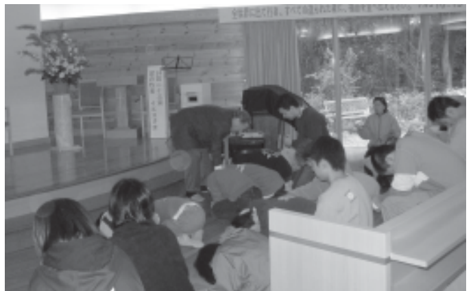
Winning Souls in JAPAN: Children accepting Jesus as their Savior.

It truly is harvest time and it is so exciting to be part of this "last day" ingathering of the largest number of souls the world has ever witnessed!