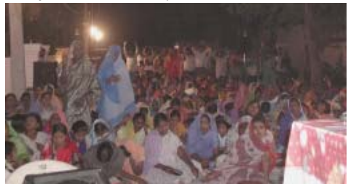
Photo: Village street crusade in Hyderabad