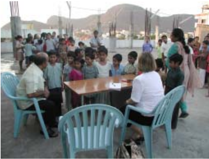
Photo: Medical camp on rooftop of Children's home in Vijayawada