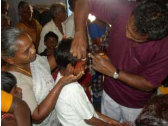
Photo: Bandaging boy at medical camp