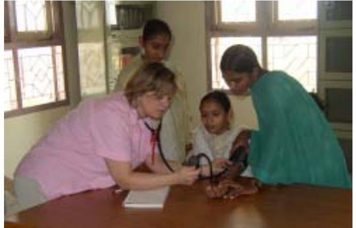
Photo: Medical camp with bible college students

difficulties with hypertension and diabetes. We also took care of an emergency situation where a mother bit her son on the head because he didn't go to school. We bandaged him and sent him for stitches. We had medicines bought and on hand to give to the people as we saw them. This was a great blessing as these people are mainly farmers and field workers and can't afford medical care.