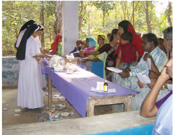
Photo: Sisters giving medicine at medical camp.

This ministry outreach was very fruitful! Only