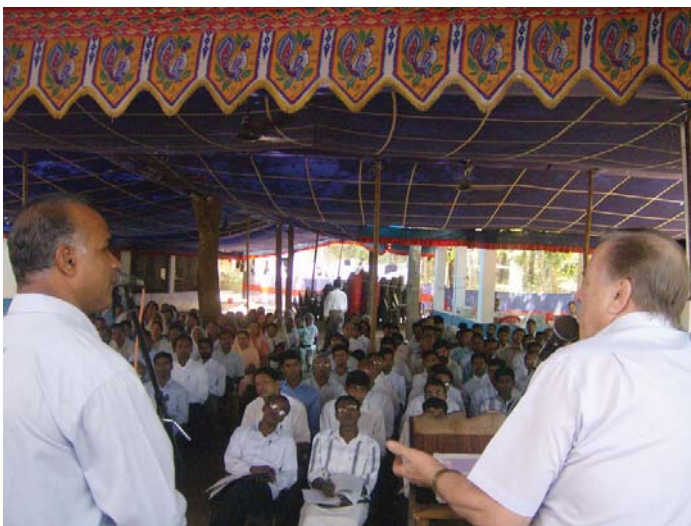
Photo: Harley Teaching Pastors.