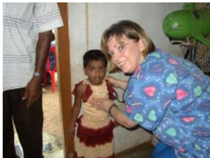
Medical Camp at second elementary school

Although the landscape changed and the language changed from state to state the people and their lives are pretty much the same. They are gracious and loving, hard working and humble. My